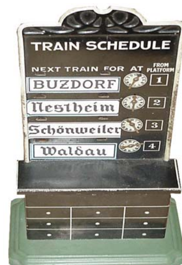
Bing Train Order Board, circa 1920-30.

It would appear that this piece was intended for the UK/US market— but why didn't Bing go all the way and use English or American city names?