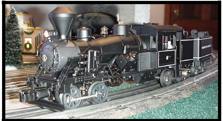
Lionel's new 3-truck Heisler logging locomotive on a test run.